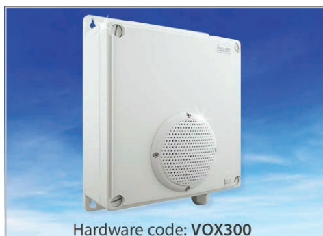
Hardware code: VOX300