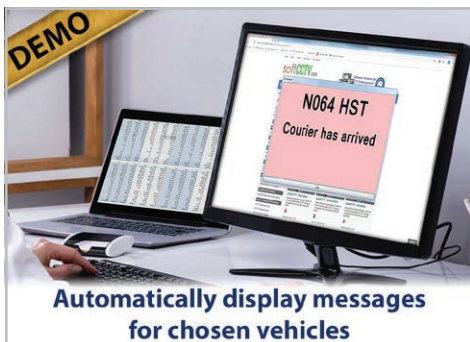
Automatically display messages for chosen vehicles

RoboPlate captures about two frames per second directly from the DVR so it is intended for slow moving traffic that stays in the field of view for a reasonable amount of time to achieve this. It is good to bear this in mind at the time of installation as you can try to position your camera facing oncoming vehicles head on where they may naturally slow down or stop such as at a gate way, barrier or narrowing of the road.