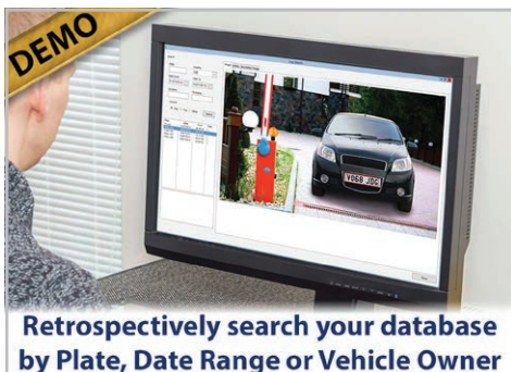
Retrospectively search your database by Plate, Date Range or Vehicle Owner

Installing the application will require approximately 85Mb initially. As images are captured the data directories will grow by about 350KB per recognition.