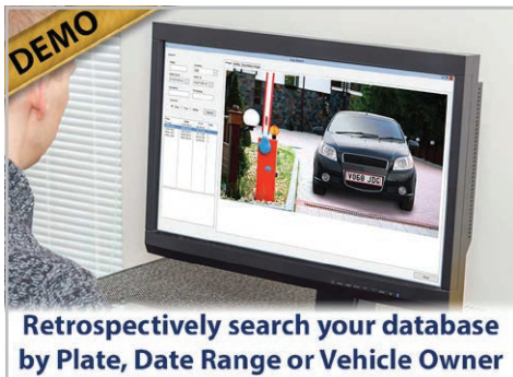
Retrospectively search your database by Plate, Date Range or Vehicle Owner