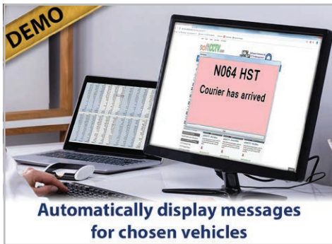
Automatically display messages for chosen vehicles