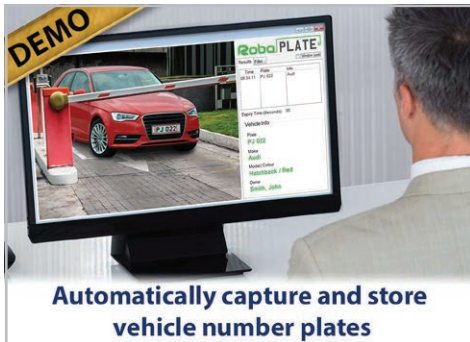
Automatically capture and store vehicle number plates

RoboPlate uses OCR / shape matching technology to identify characters by their outline. It does not look for or match to specific fonts. It expects characters to be regular upright shapes in keeping with license plate guidelines rather than fancy/italic style. Some owners of 'private plates' in the UK re-position mounting screws or deliberately change a character's shape to make their plate more desirable, in doing so, they will make recognition harder.