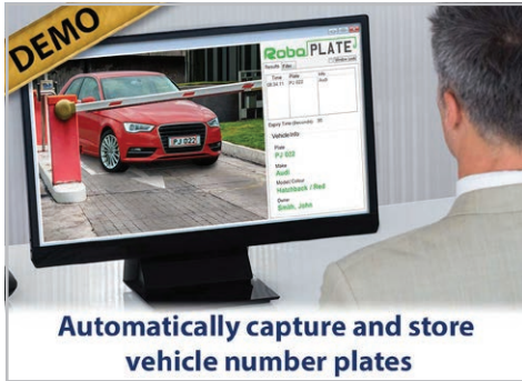
Automatically capture and store vehicle number plates

This handy add-on module is great for multisite operations where you may wish a central office to manage the results database of various sites across the country for example managing a logistics operation with multiple depots.