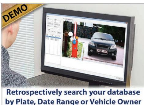
Retrospectively search your database by Plate, Date Range or Vehicle Owner

Additional modules are available to allow extra PC users to interrogate the results captured by the main program; these include both Configure and Search functions. An example might be where the main RoboPlate