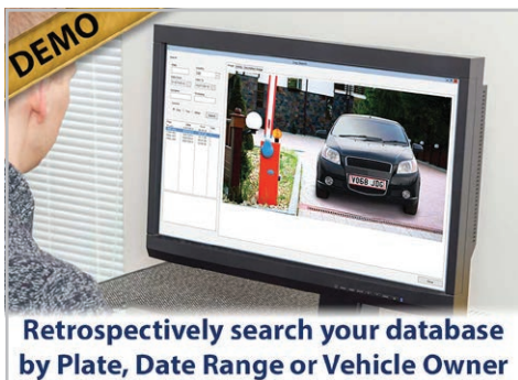
Retrospectively search your database by Plate, Date Range or Vehicle Owner