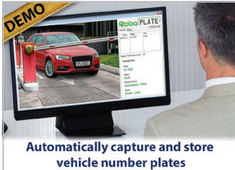
Automatically capture and store vehicle number plates

Key Holders Day - Everyday 24/7 triggers an Action Group to open main entrance gate, switch on a photocell controlled courtesy light then nothing.