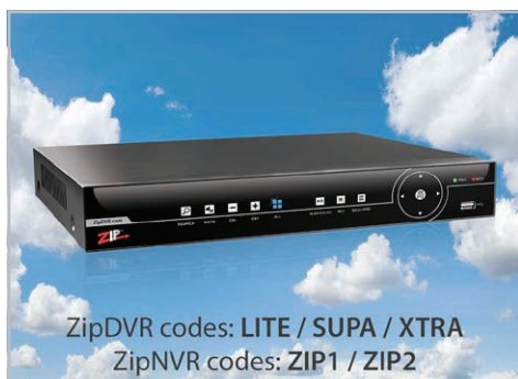
ZipDVR codes: LITE / SUPA / XTRA ZipNVR codes: ZIP1 / ZIP2