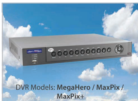
DVR Models: MegaHero / MaxPix / MaxPix+

Yes, when designing the Zippy Player we knew how important it was to see all channels at the same time when reviewing a sequence of events. The Zippy Player automatically synchronises the time of all video files you are viewing so you get to see what happened in each clip at the exact same time in a quad screen view. So when you are viewing footage from 10:37:42am on Ch1, the other 3 channels will also show what happened at 10:37:42am.